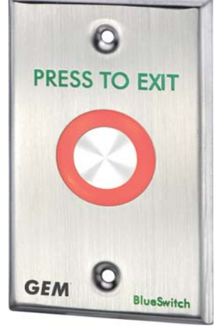
BTS-500BT ANSI single gang size

PBT-1000BT Stylish surface mounting Euro single gang size