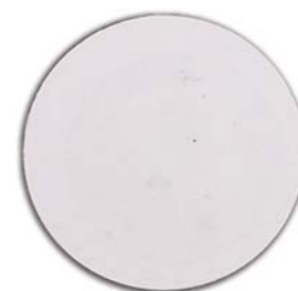
Proximity Disc Tag