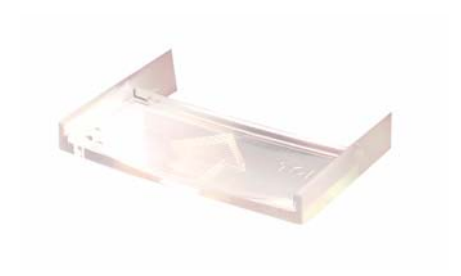
P-PL-CP-32-K Reset key