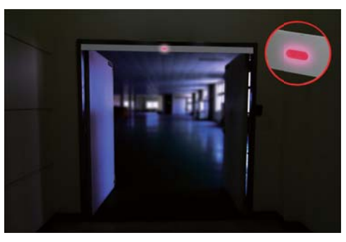
FDH Series with LED