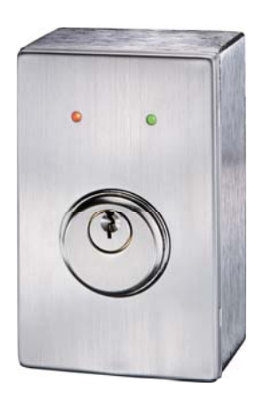
ANSI Standard Key Swtich Fits ANSI standard single-gang electrical boxes