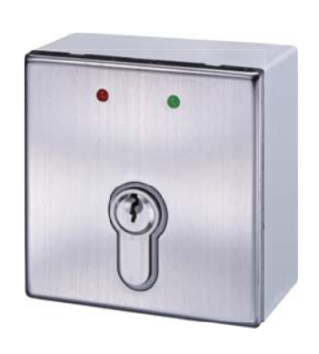
European Standard Key Switch Fits Euro standard single-gang electrical boxes