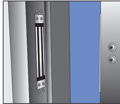
Mortise Mount (Sliding Door)